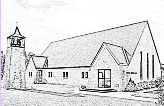
St. Charles, Artesian Saturday – 5 PM

At the name of Jesus every knee should bend, of those in heaven and on earth and under the earth, and every tongue confess that Jesus Christ is Lord, to the glory of God the Father.