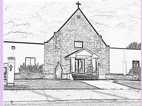
St. Joseph, Wessington Springs Jan. – June Sunday 8:30 PM July – Dec. Sunday 10:30 PM